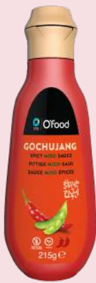
Gochujang Spicy Miso Sauce