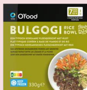
Bulgogi Rice Bowl