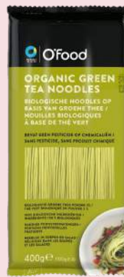
Organic Green Tea Noodles