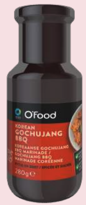
Korean Gochujang BBQ Marinade