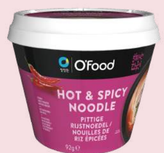
Hot & Spicy Noodle