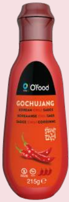
Gochujang Korean Chili Sauce