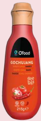
Gochujang Sweet Chili Sauce