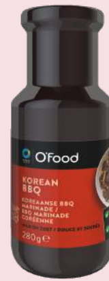
Korean BBQ Marinade